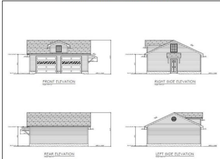
Example Exterior Building Elevations: